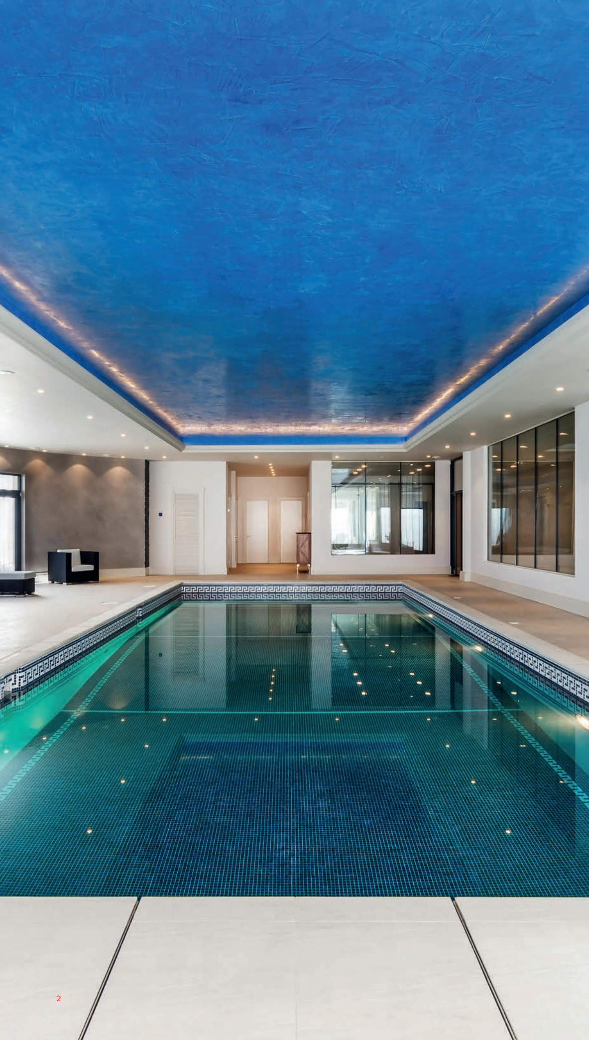
Left: We have the experience to deliver every aspect of a build, including swimming pools and spa facilities.